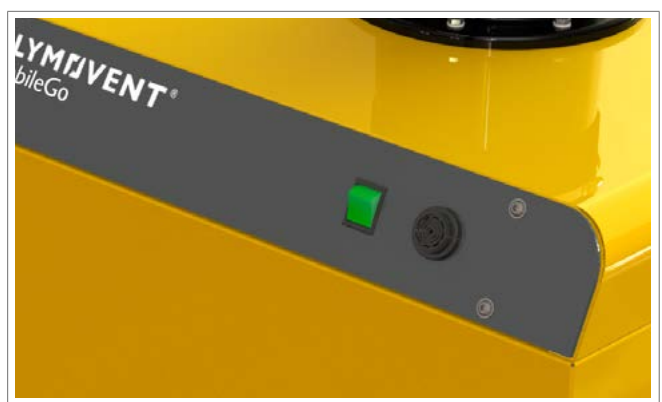
Simple control | Service indicator (buzzer) monitors the airflow