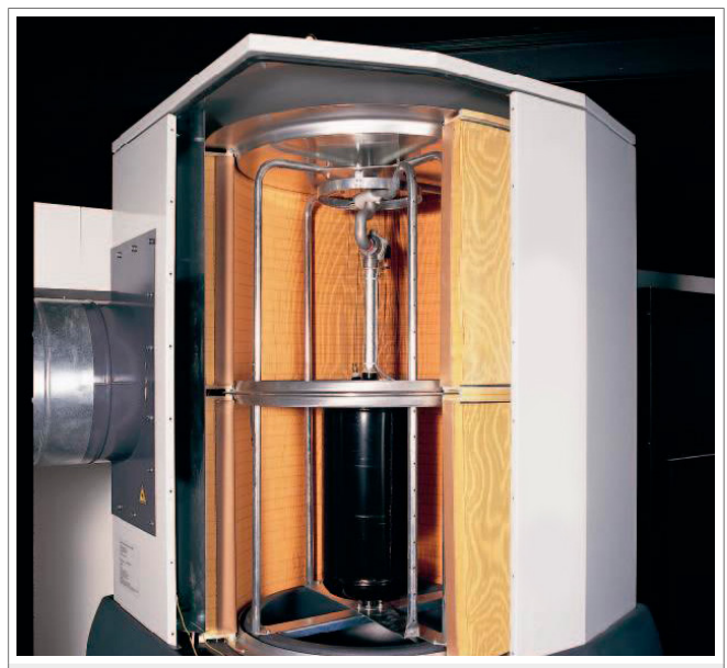
RoboCleanPlus automatic filter cleaning system