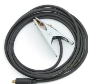
Earth return cable 5 m, 16 mm 2

150A gas cooled + Mech Gas Valve, 4m, Small DIX connector